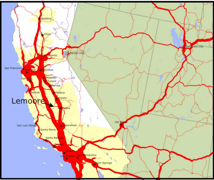
Estimated Average Annual Daily Truck Traffic: 1998